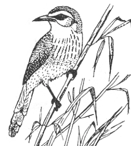
Red-capped Babbler