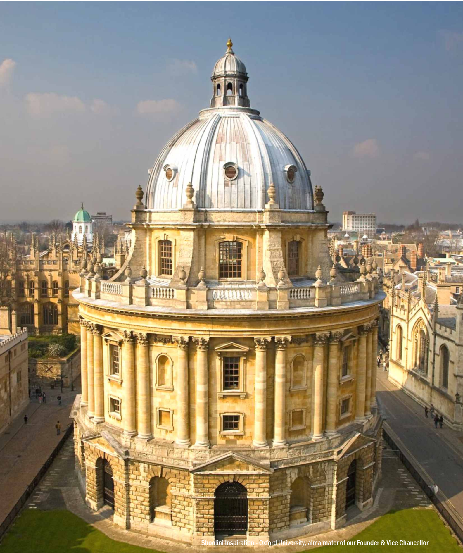
Shoolini Inspiration - Oxford University, alma mater of our Founder & Vice Chancellor