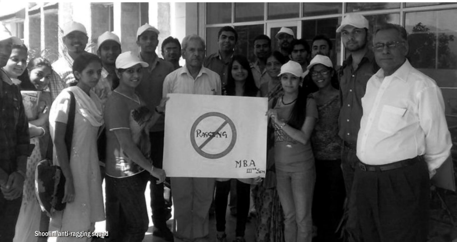
Shoolini anti-ragging squad