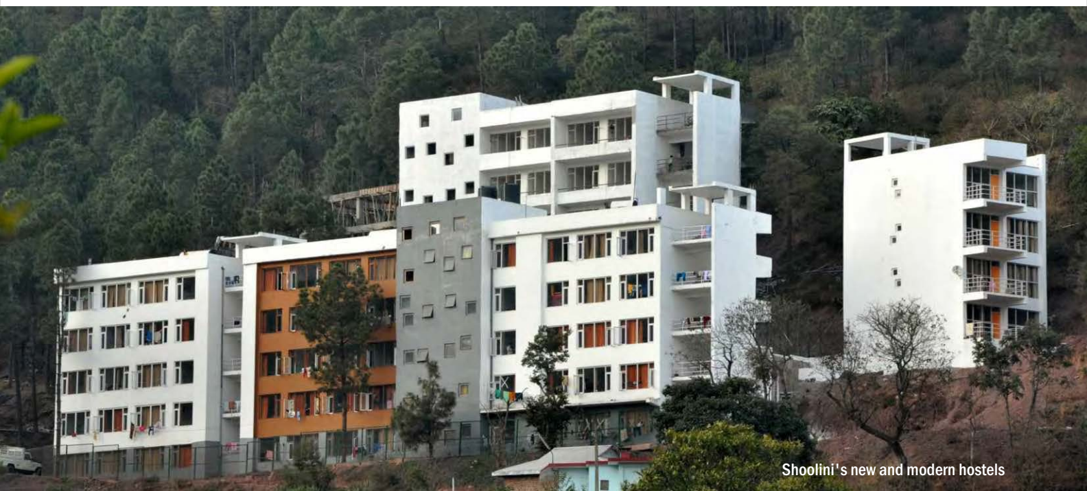
Shoolini's new and modern hostels