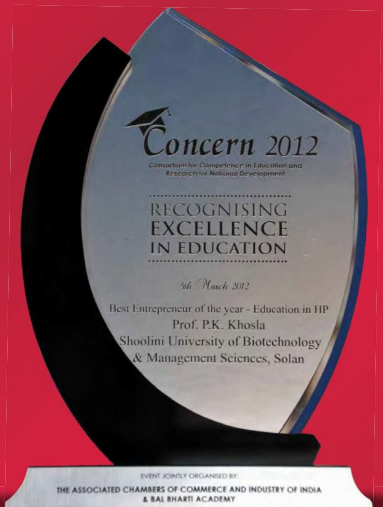
Best Entrepreneur of the year award to Shoolini recognising excellence in education