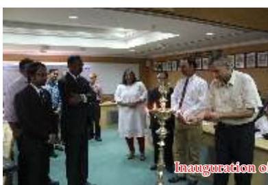
Inauguration of DFT - IIIrd Batch