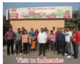
Visit to industries