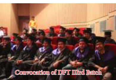
Convocation of DFT IIIrd Batch