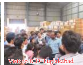
Visit to ICD Tuglakabad