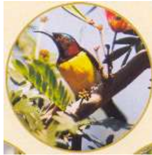
Pied Crested Cuckoo