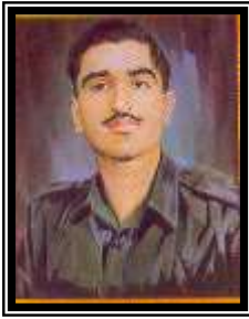
Capt GS Salaria, PVC, SC (Posthumous) 3/1 GORKHA RIFLES Congo – 05 Dec 1961