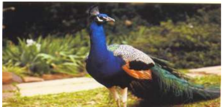
Peacock (Pavo Cristatus)