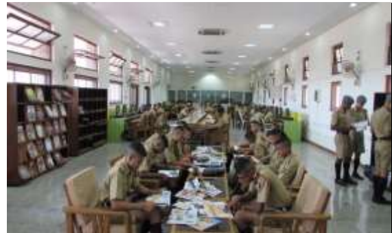
Vyas Library : Reference Section

11. The Academy has a full-fledged Computer Science Department. Limited vacancies are available for the cadets to undergo B.Sc with Computer Science. These vacancies are allotted on the basis of a screening test held at the end of the first week of the commencement of the term.