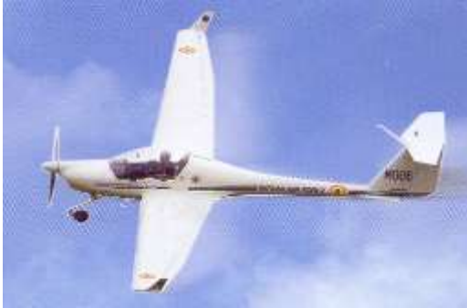
Super Dimona : Trainer Aircraft for Air Force

9. At the Academy, cadets belonging to the three services live and train together. This ensures that the future officers of the three services develop camaraderie and understand the organisation, capabilities and limitations of the other services apart from their own. Training is focused to teach cadets of all three services to operate as an integrated fighting force.