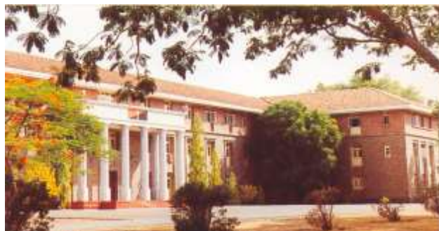
Squadron Building : Living Accommodation for Cadets