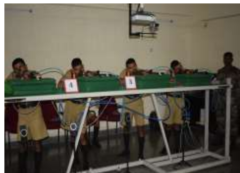
Training on Firing Simulator

12. Considerable emphasis is laid on outdoor and other extracurricular activities. The extensive facilities available for games and sports include two Olympic size swimming pools, a stadium, a well-equipped gymnasium, several squash and tennis courts, a golf course and a large number of fields for hockey, football,