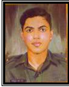
2/Lt Arun Khetarpal, PVC (Posthumous) 17 HORSE Battle of Basantar – 16 Dec 1971