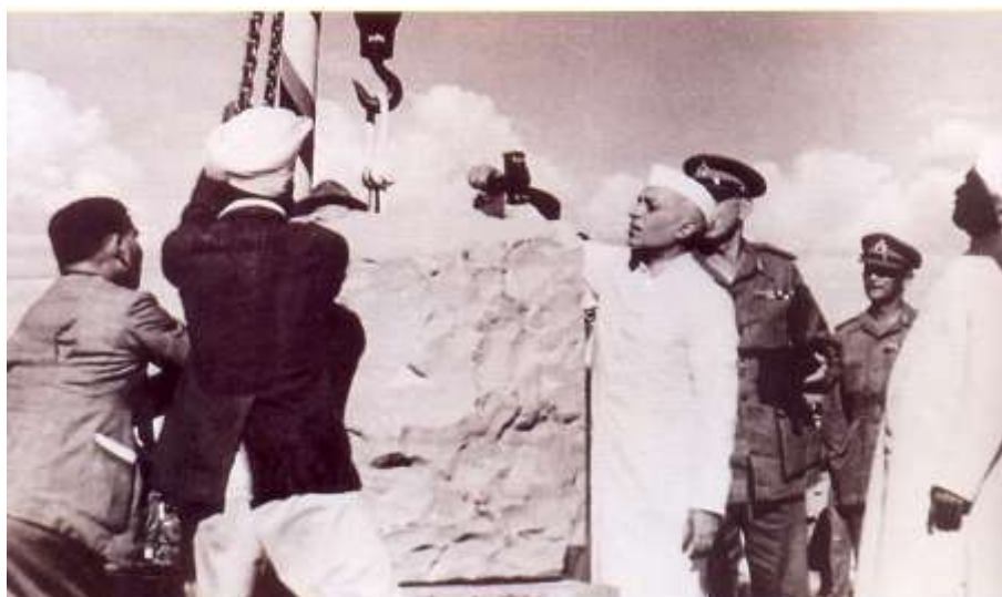
"A Monument in the Making" – Pt Nehru, the Hon'ble PM of India, laying the foundation stone at Khadakwasla on 06 Oct 1949