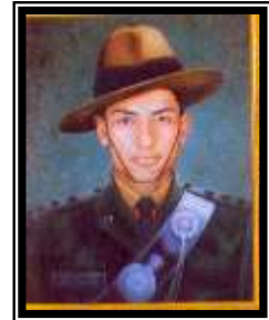
Capt Manoj Kumar Pandey, PVC (Posthumous) 1/11 GORKHA RIFLES Kargil – 02/03 July 1999