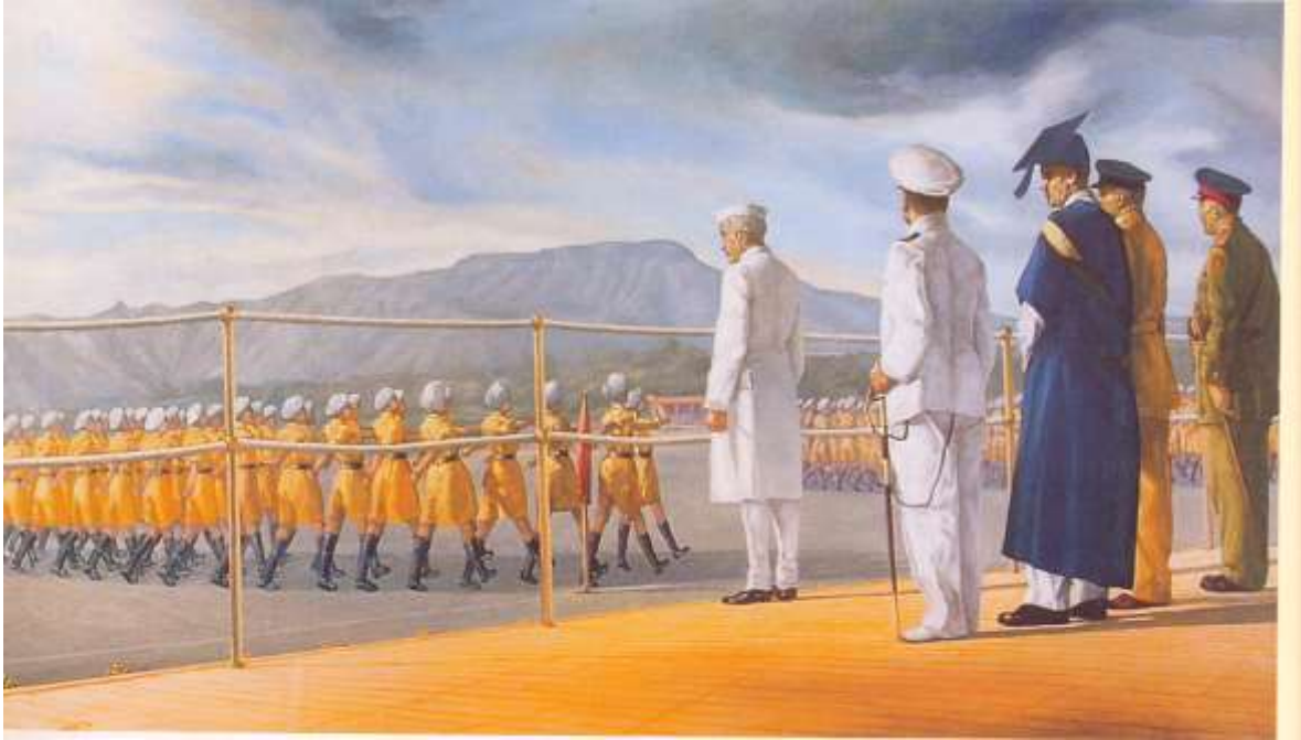
First POP(10 th Course POP) at NDA Khadakwasla, reviewed by Pt Jawaharlal Nehru,Hon'ble PM of India on 05Jun 55

5. The NDA in its various forms has completed sixty years of eventful service to the nation in January 2009. This institution is proud of having produced more than 35,000 officers for the Indian Armed Forces and 800 officers for friendly foreign countries. These officers have imbibed academic and military training of the highest standards in an unique inter-services ambience. NDA is also proud that its alumni have been awarded with nation's highest awards for gallantry and distinguished service, both in peace and war. We cherish with pride the Roll of honour of so many other former NDA cadets who have laid down their lives in battle to uphold the safety and integrity of our country. The NDA has also the distinction of 33 of its alumnus reaching the pinnacle of military achievement by becoming Chiefs of their respective Services are as under :-