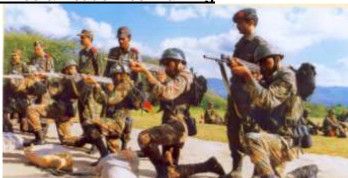
Firing Trg for Army Cadets at the Long Range