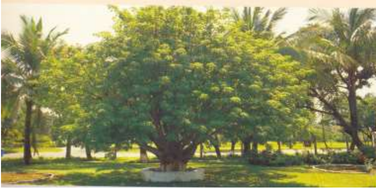
Baobab (Adansonia Digitata) and Coconut Palm (Cocos ucifera)

13. Spread over 6780 acres, the NDA has a salubrious climate with a mean temperature of 24.3 0 C, pollution free environment, elaborate infrastructure and a wide variety of flora & fauna. The months of March to May are warm and monsoon is experienced from June to September. Winters are mild. Blankets/quilts are necessary during Dec to Feb.