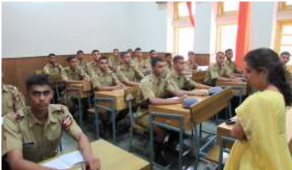
Academics class in progress

10. A major portion of the curriculum is conducted in the academic class rooms. The academic syllabus is so formulated that it is an integrated one, designed to meet the specific requirements of the Armed Forces. Cadets are taught a large number of subjects of Science, Computer Science and Social Science. The aim is to provide broad based education to widen horizons and make them capable of understanding and tackling problems that may confront them in their service careers. They are also given training in military science so that they understand the military technology in order to exploit the modern weapon-systems in the Armed Forces.