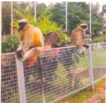
Common Langur (Presbytis Entellus)