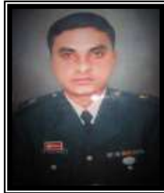
Maj Dinesh Raghu Raman, AC (Posthumous) 19 JAT CI Ops – 02 Oct 2007