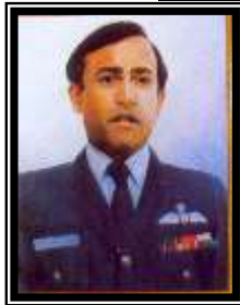
Wg Cdr Rakesh Sharma, AC (Astronaut) Indian Air Force 03 April 1984