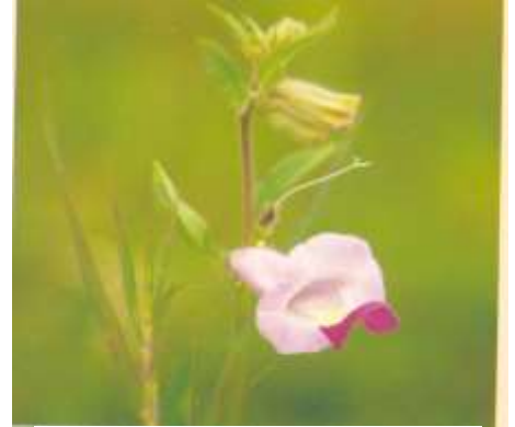
Wild Sesame (Sesamum Indicum)