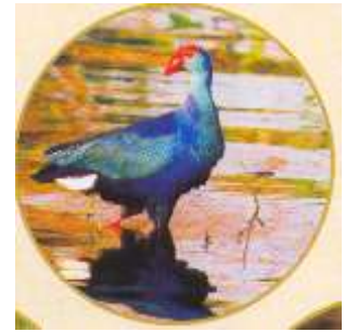
Blue Rock Pigeon