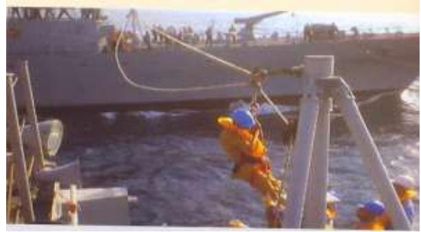
Naval Cadets undergoing training on a Ship

10. A major portion of the curriculum is conducted in the academic class rooms. The academic syllabus is so formulated that it is an integrated one, designed to meet the specific requirements of the Armed Forces. Cadets are taught a large number of subjects of Science, Computer Science and Social Science. The aim is to provide broad based education to widen horizons and make them capable of understanding and tackling problems that may confront them in their service careers. They are also given training in military science so that they understand the military technology in order to exploit the modern weapon-systems in the Armed Forces.