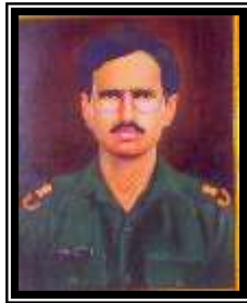
Maj RK Joon, AC (Posthumous), 22 GRENADIERS CI Ops J&K – 16 Sep 1994