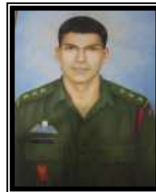
Capt Harshan R, AC (Posthumous) 2 PARA (Special Forces) CI Ops J&K-2007