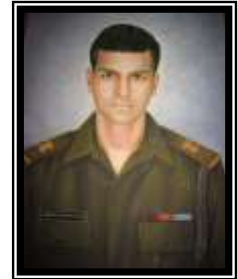
Maj S Unnikrishnan, AC (Posthumous) 7 BIHAR Op Black Tornado – 09 Nov 2009