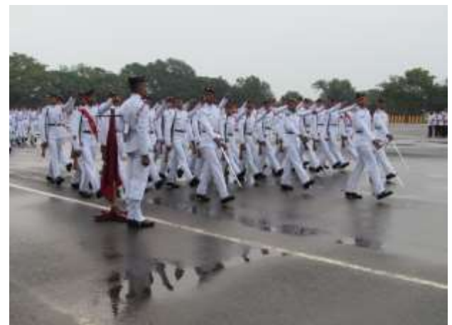
Drill training at Khetrapal Parade Ground