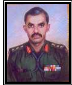
Col NJ Nair, AC (Posthumous), KC 16 MARATHA LI CI Ops Nagaland – 20 Dec 1993