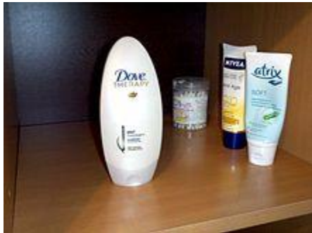
Some hygiene accessories.