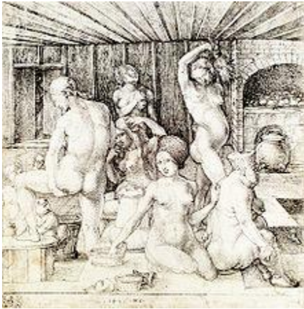
Woman's Bath, 1496, by Albrecht Dürer

There was a certain deacon who followed the habits of the Italians in that he was perpetually trying to resist nature. He used to take baths, he had his head very closely shaved, he polished his skin, he cleaned his nail, he had his hair cut as short as if it were turned on a lathe, and he wore linen underclothes and a snow-white shirt.