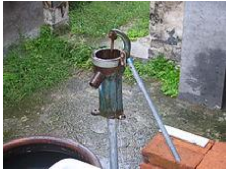
A manual water pump in China

Water is excreted from the body in multiple forms; including urine and feces, sweating, and by water vapour in the exhaled breath. Therefore it is necessary to adequately rehydrate to replace lost fluids.