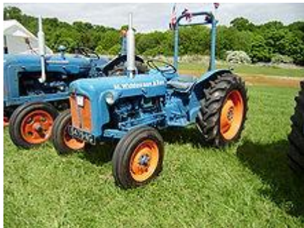
Rollover protection bar on a Fords on tractor.

Agriculture workers are often at risk of work-related injuries, lung disease, noise-induced hearing loss, skin disease, as well as certain cancers related to chemical use or prolonged sun exposure. On industrialized farms, injuries frequently involve the use of agricultural machinery. The most common cause of fatal agricultural injuries in the United States is tractor rollovers, which can be prevented by the use of roll over protection structures which limit the risk of injury in case a tractor rolls over. Pesticides and other chemicals used in farming can also be hazardous to worker health, and workers exposed to pesticides may experience illnesses or birth defects. As an industry in which families, including children, commonly work alongside their families,