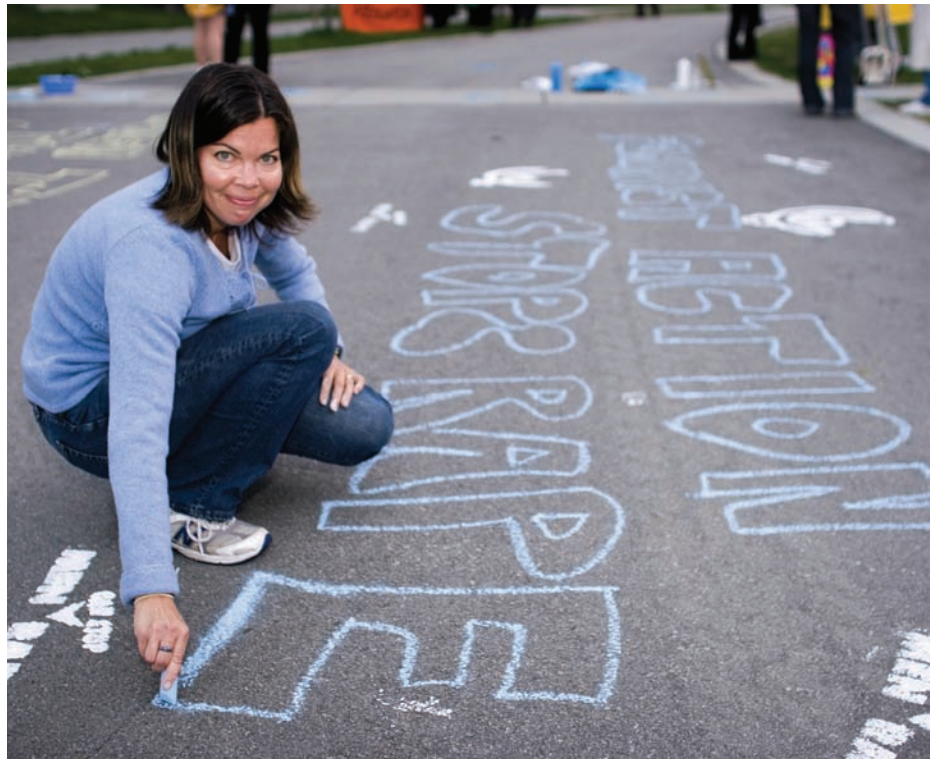
Vancouver's Take Back the Night March, 2005.

As an act of resistance to the fear and violence women are subjected to by some men in both private and public spaces, women from around the world gather each fall in their local communities and march together in the streets. It is a collective call—a demand—for safe environments at night free from danger and the need for male escorts. Originating in Germany decades ago after a series of rapes, murders, and assaults against women, these rallies spread to other parts of Europe, then England, the United States, and Canada. The first march in North America was in San Francisco in 1978, when 3,000 women took to the street, and coined the phrase, 'take back the night.' The event now occurs coast to coast in Canada each year with thousands of participants. For symbolic purposes men are excluded from the march itself—these public streets are temporarily disrupted and claimed by women for women—but men are both welcomed and encouraged to support their female friends, sisters, mothers, daughters, aunts, cousins, co-workers, employers, neighbours, partners, and wives, by offering words of encouragement and distributing flyers from the sidelines.