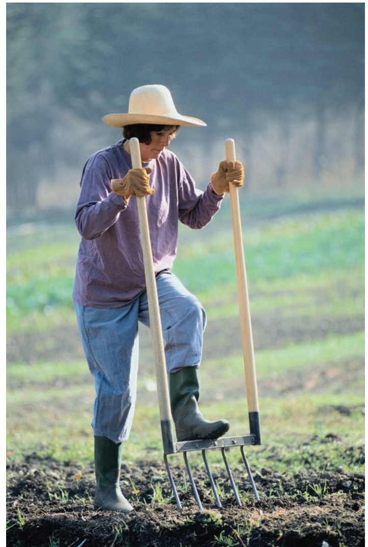
FIGURE 4 Female Farmers on the Rise. Farming in North America has historically been a male-dominated industry. This is changing: the woman depicted here is part of a growing trend in the United States and Canada of farms managed by women. In the U.S., females run ten percent of all farms.

Leckie's (1993) study on female farmers in Canada highlights this gap in the geographical literature. Using data from several decades of Canadian censuses on agriculture and population, she compared the social, economic, and farming profiles of male and female farmers. Women comprised just below 5% of all farm operators in Canada, but were growing in numbers relative to a decline in male farmers. Female-operated farms were on average smaller in size, thus generating a smaller volume of sales, but were carrying less debt. The females were more likely than males to be growing fruits or vegetable and less likely to be operating dairy, hog, and grains farms. They were on average slightly older than their male counterparts, 50.3 years and 47.9 years respectively,