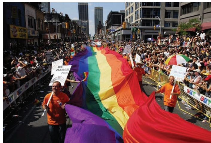
FIGURE 5 Toronto Gay Pride Parade 2007. The origins of this peaceful event date back to a violent one at the Stonewall Inn in New York City during June, 1969. Up until that time, police raids on gay bars regularly occurred and patrons were routinely charged with ‘acts of indecency’: kissing, holding hands, wearing opposite engendered clothing. During one particular raid, patrons fought back, and later organized a protest march, The March on Stonewall . This event is considered the flashpoint of gay and lesbian activism in North America.

One of the key tenets of patriarchal masculinity noted above is compulsory heterosexuality. From that perspective, it is assumed that all ‘normal’ men and women are heterosexual : they desire or engage exclusively in sexual relations with those of the opposite sex. Because this belief is so entrenched in patriarchy, feminist geographers argue that patriarchy and heterosexism are indivisible, hence the term ‘ heteropatriarchy ’ (Valentine, 1995). Heterosexism is a way of thinking and doing that privileges heterosexuality