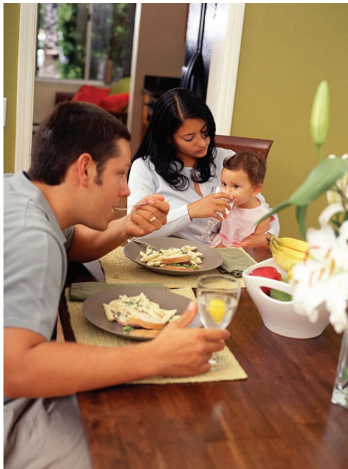
FIGURE 2 The “traditional” family. Held up by many in North America as the ‘Traditional’ family, those Canadian households composed of Mom, Dad, and the children form a minority at 44 percent, including both married and common-law couples. Although the ‘traditional’ family remains the most common structure, the majority of Canadians have alternative compositions: no children, no children at home, divorced, single, partner lives elsewhere, or separated. Family takes on multiple forms and meanings for different people (Statistics Canada, 2001).

This enlargement of domestic space had several profound impacts for the participants. More secure child rearing space outside of the home gave the women more time: they did not