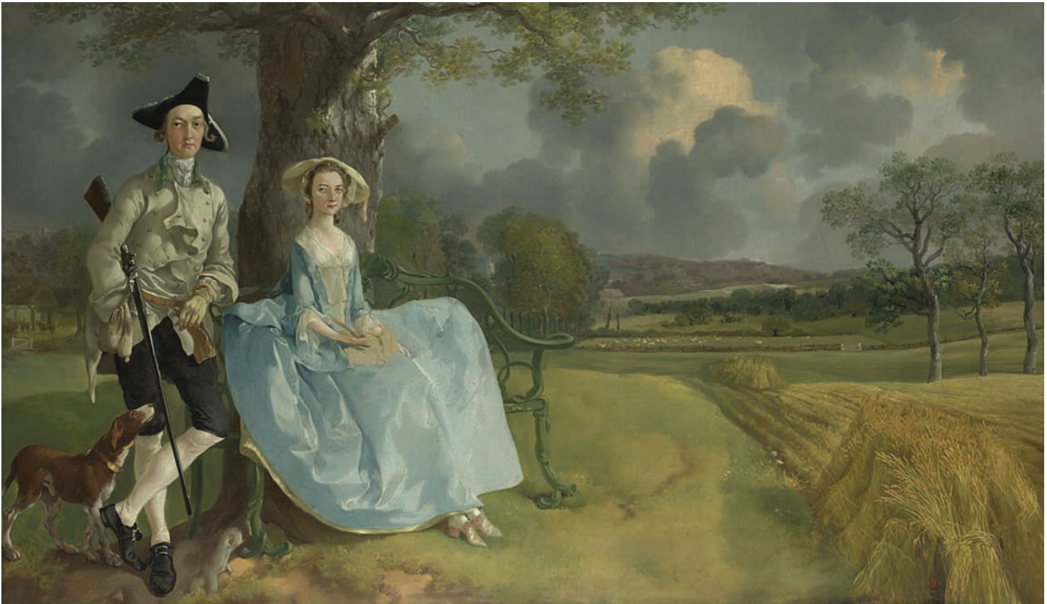
FIGURE 1 Mr and Mrs Andrews , by Thomas Gainsborough.